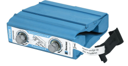
Wedge & Wedgekit

For detailed information, please visit roxtec.com .